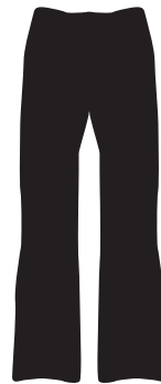
Long Pants (Jeans)