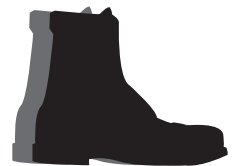
Boots (with heel!)